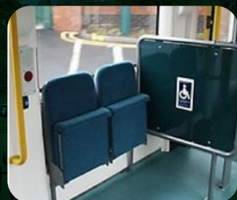
Diagram 1 Wheelchair and Pushchair Bay