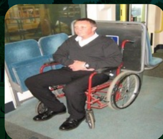
Diagram 1 Wheelchair positioned correctly in bay