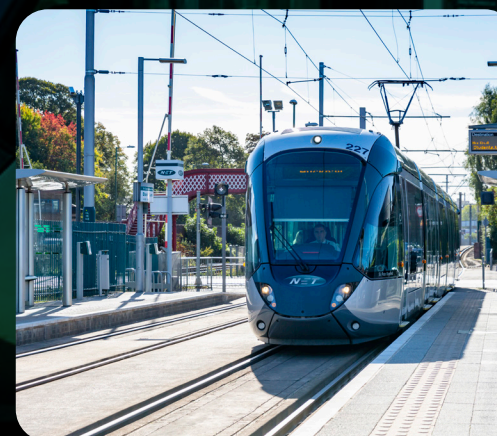
NET tram stop