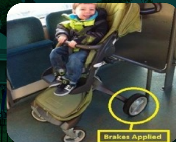
Diagram 3 Pushchair positioned correctly in bay